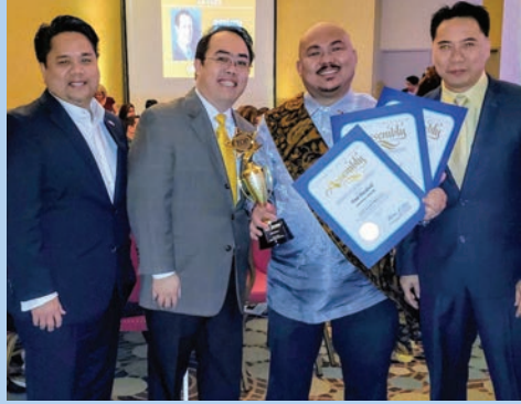
The Outstanding Pilipino (TOP) Awards

Construction is currently in full swing to prepare the upcoming home of the brand new division of Nikkei Credit Union in Carson, CA, Mabuhay Credit Union! Located in the heart of Carson, on the corner of Carson and Main Streets, this new branch is scheduled for a Grand Opening on Tuesday, June 11, 2019. Mabuhay CU aims to cater to the financial services needs of the Filipino / Filipino-American and greater community in the South Bay, Los Angeles area and beyond, by: