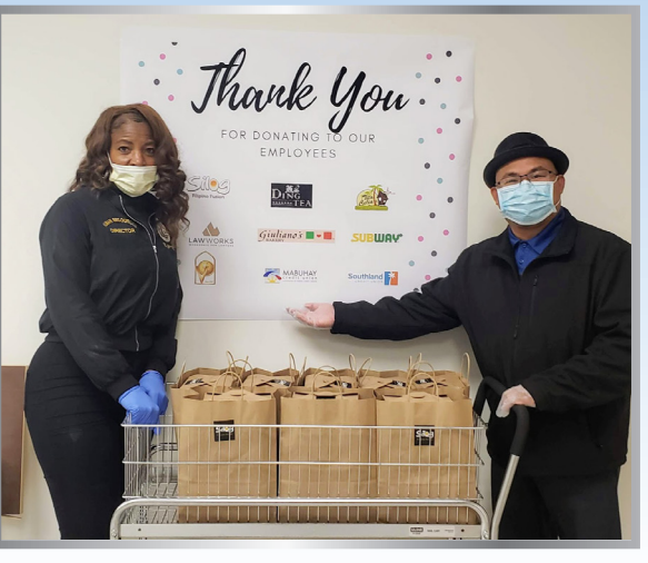
Nikkei Credit Union donated lunch to healthcare workers at Harbor UCLA Hospital.

Our credit union is grateful for the support of our generous members. During these unprecedented times, we have come together as a community and given back with acts of kindness. Recently, we partnered with Silog Restaurant and donated meals to health care workers at Torrance Memorial, Gardena Memorial, and Harbor UCLA Hospital.