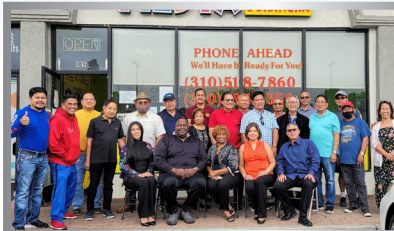
Mayor's Town Hall and Q&A in Carson