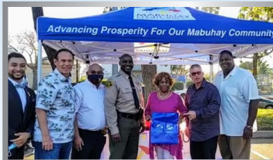
Carson Sheriff Department Community Night Out Caravan