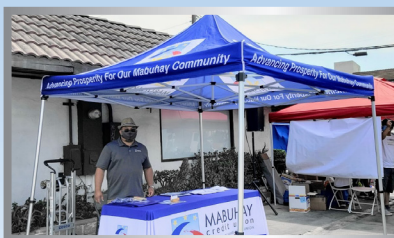
Small Business Pop-up in Carson

Not only did we receive the City's Official Proclamation of the 4th of July being Filipino American Friendship Day, but we also got an opportunity to support the City of Carson, CA's actual celebration of this event as well. We were also able to continue supporting community events such as the Carson Sheriff Department's Community Night Out celebration and the Mayor's Town Hall and Q&A. In addition to our ongoing campaigns such as our Membership Appreciation Shred Day and #MabuhayCares / #NikkeiCares donations towards homeless college students.