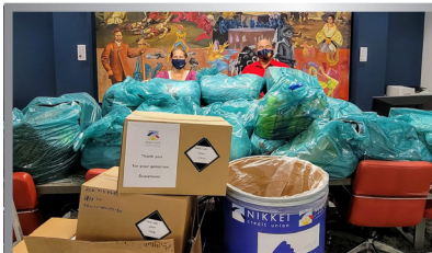
#NikkeiCares / #MabuhayCares donation to El Camino College