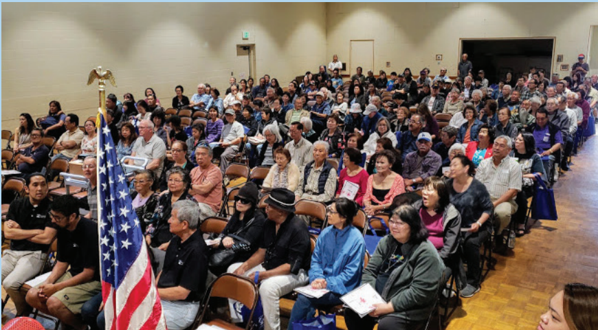
Gardena Buddhist Church Japanese Language School Graduation. June 16, 2018 (Saturday)