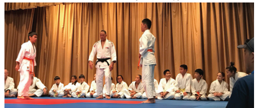
Japanese American Cultural and Community Center (JACCC) Fiesta Matsuri. May 6, 2018 (Sunday)