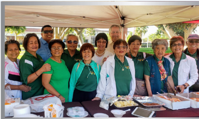
Dreamers & Visionaries of South Bay, Inc. 52