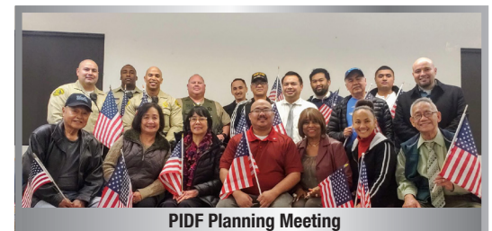
PIDF Planning Meeting

There are several events planned for the Nikkei and Mabuhay communities. Please visit www.nikkeicu.org for a list of upcoming events.