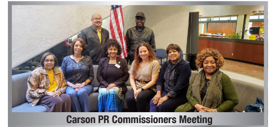
Carson PR Commissioners Meeting