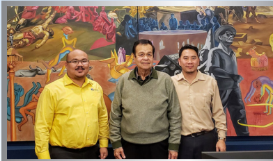
Cabanatuan City Association California, Inc. 360