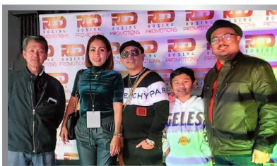
RED Boxing International Promotions 53