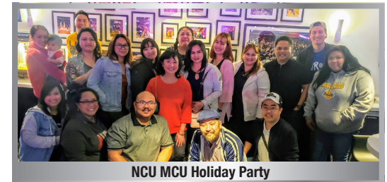
NCU MCU Holiday Party