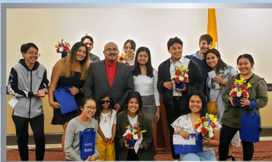
USC Troy Philippines 120

Mabuhay recently welcomed four new SEG/Association partners so that more people from our community can benefit from membership. Mabuhay Credit Union® is happy to help support these organizations by sponsoring their events and activities, as well as provide their employees the financial service they need. Our new SEG/Association partners and the number of employees/members that they represent are: