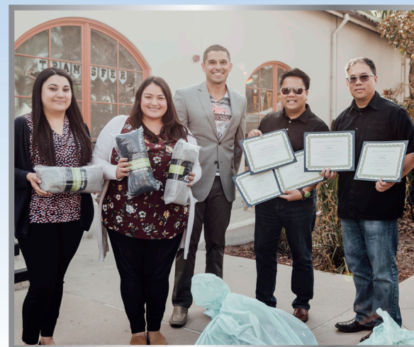
Nikkei CU CEO with Long Beach City College Counselors receiving donated clothes, blankets and personal hygiene products for their homeless college students.

We make a strong effort to help as many people as possible through volunteering and charitable donations. In both of our branches, we have donation bins to collect blankets, clothing, canned food, and personal hygiene products to help homeless students in the South Bay area.