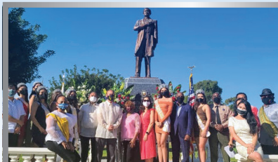
FilAm History Month Kick-Off Celebration

Closing up the year in December, celebrations included an "A Night of Pop & RnB" Concert in Torrance and a Filipino Christmas Festival that we sponsored for our community called the Long Beach Parol Lantern Festival, along with a variety of Holiday networking events and Christmas parties. We ended the year by hosting a Fundraising Event with boxing champion Nonito "The Filipino Flash" Donaire to benefit the victims of Super Typhoon Rai in the Philippines.