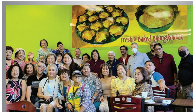
Filipino Community of Carson Meeting