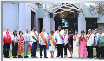
Philippine Independence Day Foundation Flag Raising

Finally, over the past year, we successfully launched several worthwhile campaigns for our community. These include #NikkeiCares / #MabuhayCares, multiple feeding donations for front-liners, the Spotlight TV Platinum Sponsorship, Mabuhay Heroes Recognition, and the Mabuhay Community Corner Vlog / Podcast.