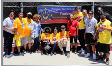
Philippine Independence Day Foundation Basketball Tournament Day