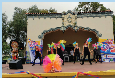
MassKara Festival by Long Beach Bacolod Association