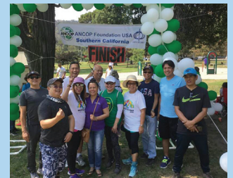
ANCOP Global Walk with Couples for Christ - USA