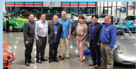
Advisory Council Meeting